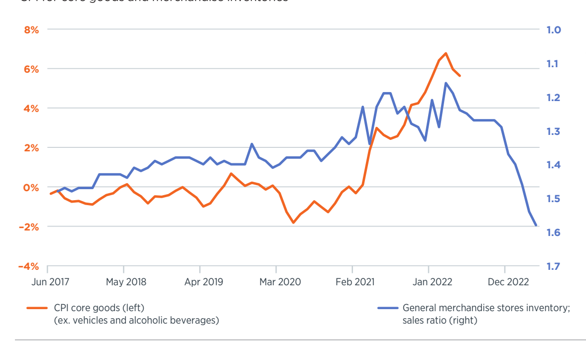
Figure 3 Declining prices for goods as retailers look to offload inventory CPI for core goods and merchandise inventories

Data as of May 31, 2022. Inventory-sales ratio is lagged by 12 months. CPI core goods is % year over year.